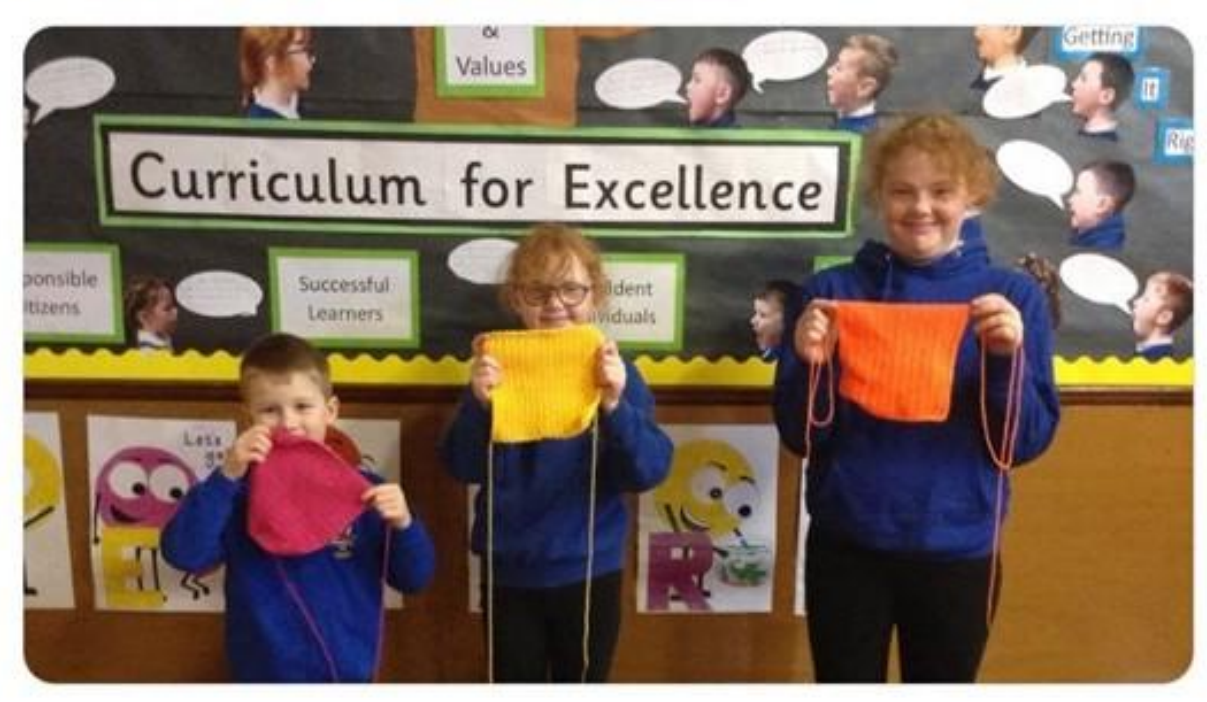
"He's going to be gigantic!"

Bracoden Primary School showcased their creativity and teamwork by knitting their own BIG CAL. Pupils and volunteers collaborated to bring this special project to life, celebrating wellbeing through craft and community.